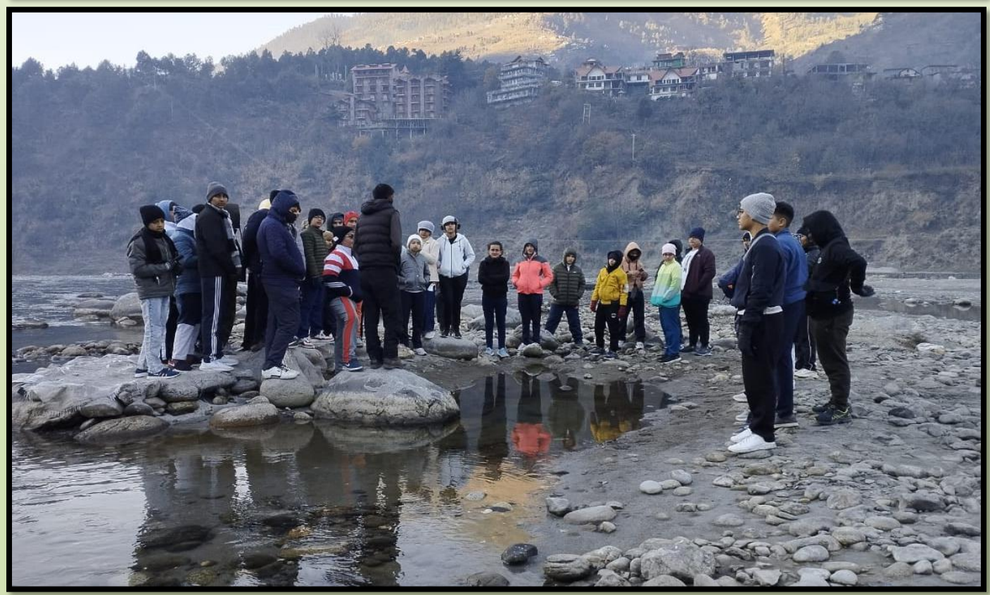
"Man cannot discover new oceans unless he has the courage to lose sight of the shore." - Andre Gide