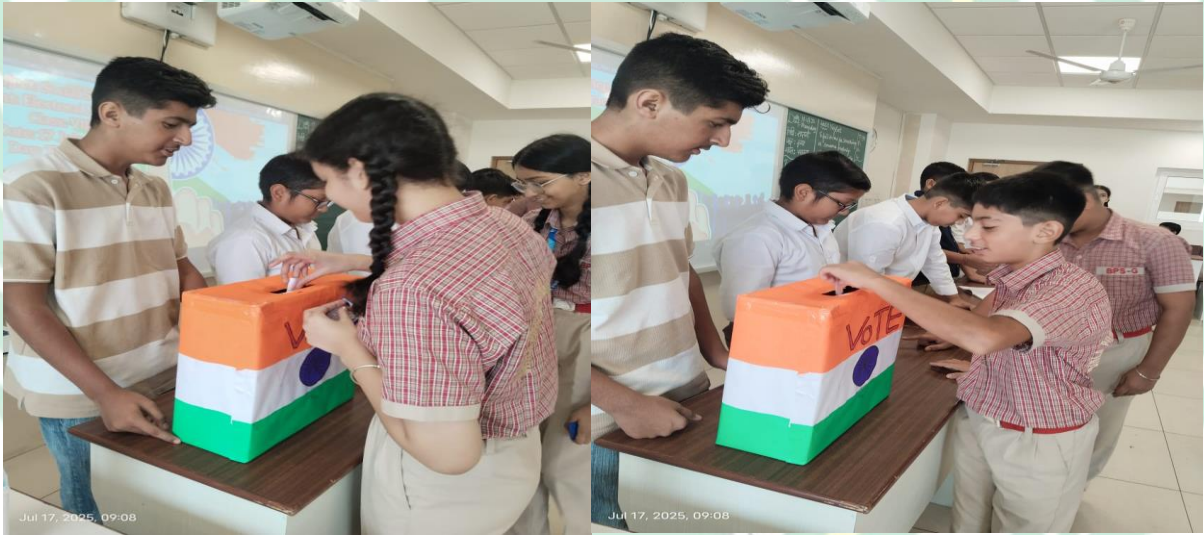
Jul 17, 2025, 09:08